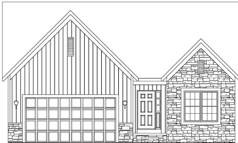
Modern Farm House Front Elevation

Some optional features may be shown or discussed. See ProBuilt sales associate for details and standard features. Floor plans are subject to change. This rendering and floor plans are for illustrative purposes only and are not intended to be a part of any purchase agreement or construction contract. In the interest of continued product improvement and the challenge of material availability, builder reserves the right to modify plans, specifications, and standard features without notice.