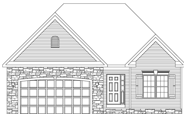
Optional Hip Roof Front Elevation

Some optional features may be shown or discussed. See ProBuilt sales associate for details and standard features. Floor plans are subject to change. This rendering and floor plans are for illustrative purposes only and are not intended to be a part of any purchase agreement or construction contract. In the interest of continued product improvement and the challenge of material availability, builder reserves the right to modify plans, specifications, and standard features without notice.