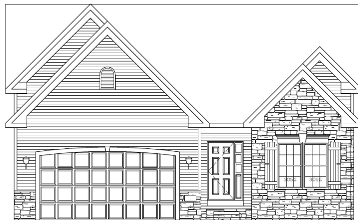
Additional Gable Front Elevation #2

Some optional features may be shown or discussed. See ProBuilt sales associate for details and standard features. Floor plans are subject to change. This rendering and floor plans are for illustrative purposes only and are not intended to be a part of any purchase agreement or construction contract. In the interest of continued product improvement and the challenge of material availability, builder reserves the right to modify plans, specifications, and standard features without notice.