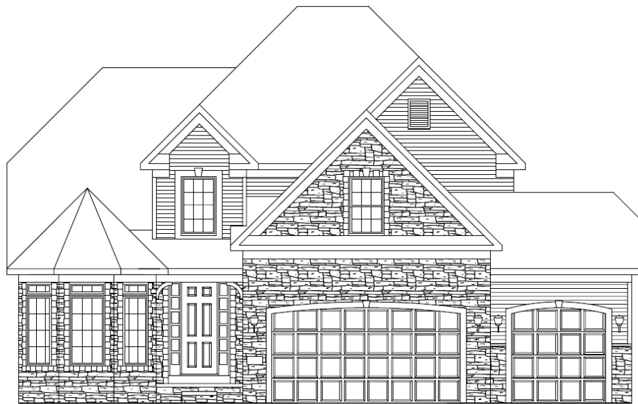
Optional Front Elevation #1

Some optional features may be shown or discussed. See ProBuilt sales associate for details and standard features. Floor plans are subject to change. This rendering and floor plans are for illustrative purposes only and are not intended to be a part of any purchase agreement or construction contract. In the interest of continued product improvement and the challenge of material availability, builder reserves the right to modify plans, specifications, and standard features without notice.