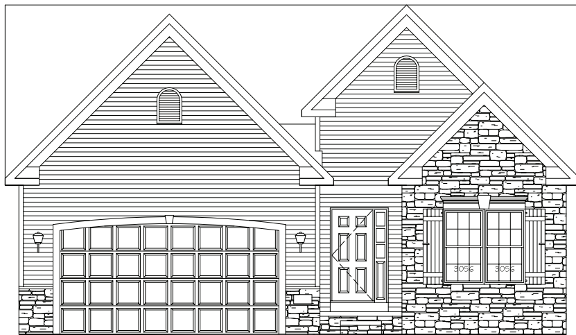
Additional Gable Elevation Option 3

Some optional features may be shown or discussed. See ProBUILT sales associate for details and standard features. Floor plans subject to change. This rendering and floor plan are for illustrative purposes only and are not intended to be part of any purchase agreement or construction contract. In the interest of continued product improvement and the challenge of material availability, builder reserves the right to modify plans, specifications and standard features without notice. This home plan is the exclusive copyright of ProBUILT Homes or the plan designer. All rights reserved. Reproduction of this plan, either in whole or in part, including any form of copying or derivative works therefrom, is strictly prohibited.