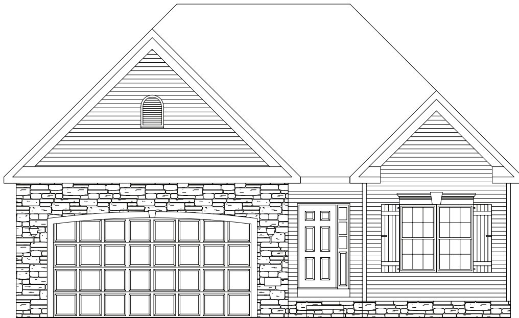
Optional Hip Roof Elevation

Some optional features may be shown or discussed. See ProBuilt sales associate for details and standard features. Floor plans subject to change. This rendering and floor plan are for illustrative purposes only and are not intended to be part of any purchase agreement or construction contract. In the interest of continued product improvement and the challenge of material availability, builder reserves the right to modify plans, specifications and standard features without notice. This home plan is the exclusive copyright of ProBuilt Homes or the plan designer. All rights reserved. Reproduction of this plan, either in whole or in part, including any form of copying or derivative works therefrom, is strictly prohibited.