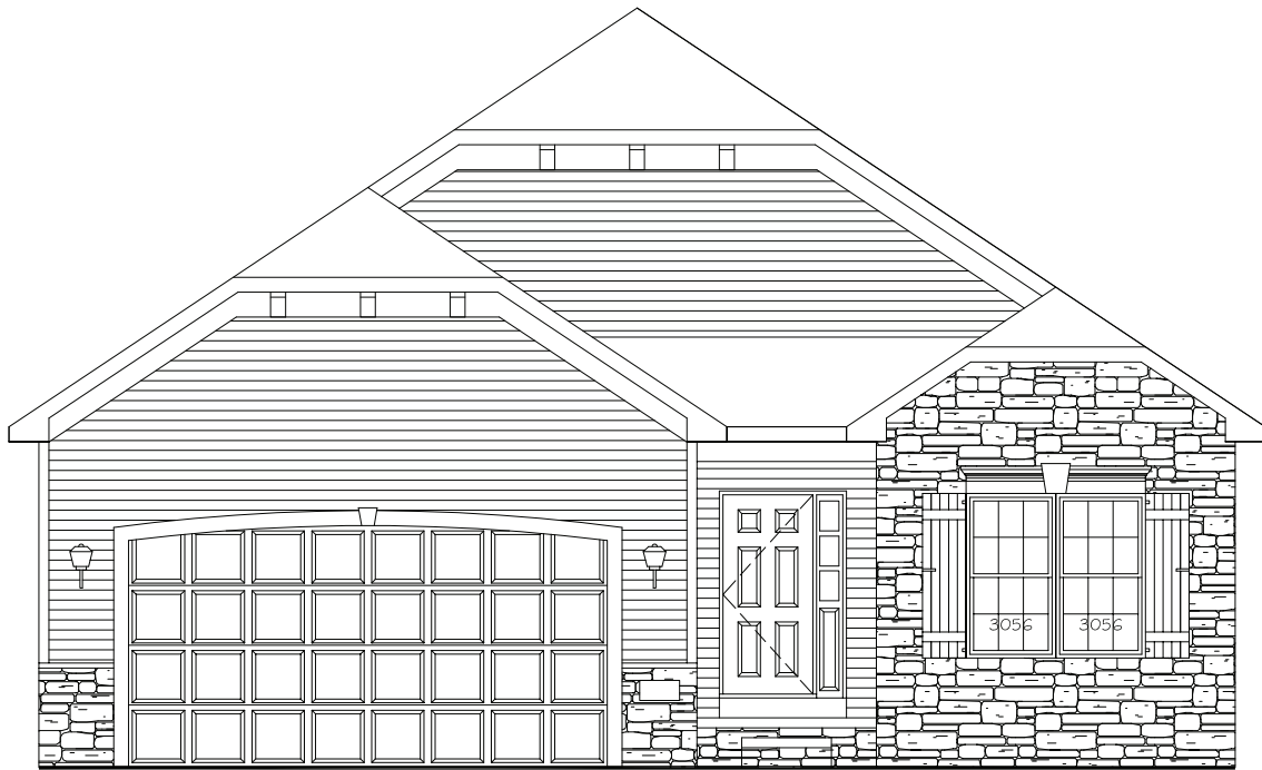
Optional Craftsman Elevation