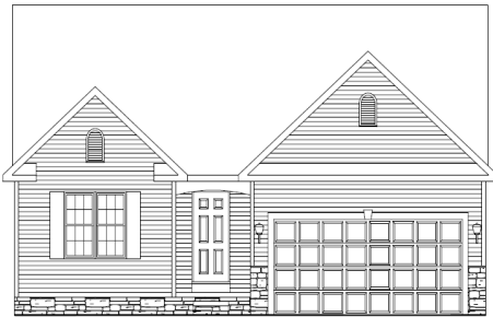
Briarwood * 2,064 Sq. Ft. 3/4 Bedrooms * 2.5 Baths