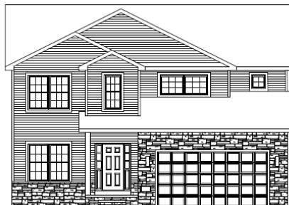
Avery * 2,702 Sq. Ft. 4 Bedrooms * 2.5 Baths