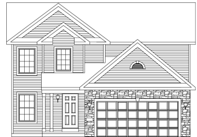
Melborne * 1,899 Sq. Ft. 4 Bedrooms * 2 Baths