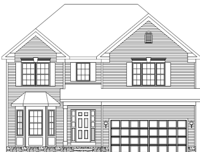
Kingston * 2,594 Sq. Ft. 4 Bedrooms * 2.5 Baths