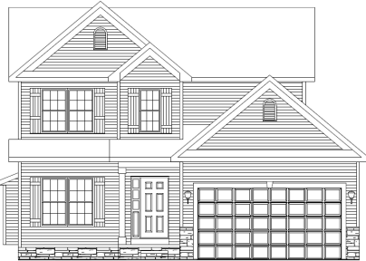
Ashby * 1,820 Sq. Ft. 3 Bedrooms * 2.5 Baths