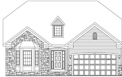
Eadon 1828 * 1,828 Sq. Ft. 3 Bedrooms * 2 Baths