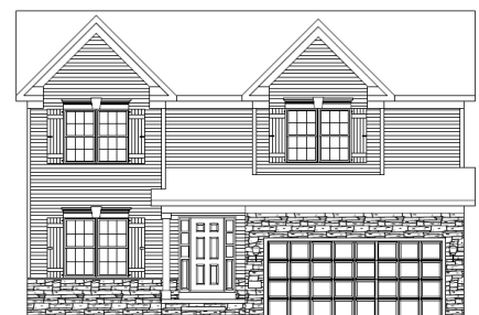
Yorktown * 2,114 Sq. Ft. 4 Bedrooms * 2.5 Baths

ProBUILT Homes * 9124 Tyler Blvd., Mentor, OH 44060 * www.probuilt-homes.com