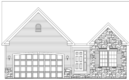
Barksley * 1,747 Sq. Ft. 3 Bedrooms * 2 Baths