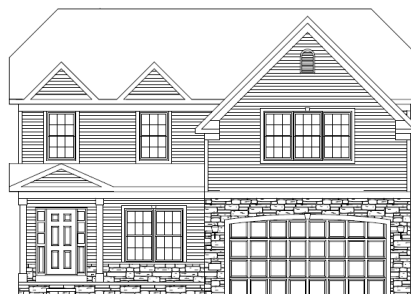
McIntosh * 2,526 Sq. Ft. 4 Bedrooms * 2.5 Baths