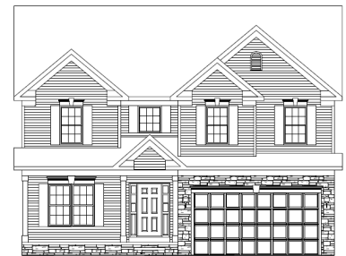
Cornwell * 2,807 Sq. Ft. 4 Bedrooms * 2.5 Baths